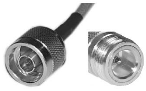
N Connectors (Male - Female)