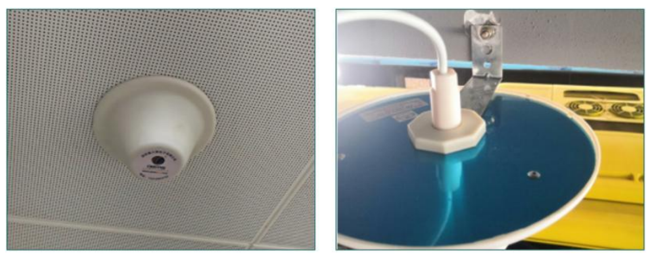
This product factory with fixed bracket, you can refer to the diagram to fix

Fix the antenna to the ceiling, or to a concrete beam; usually in the center of the area where GPS signal coverage is required;